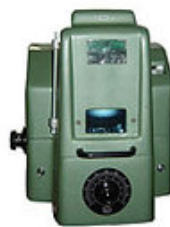
Infra Red Moisture Balance