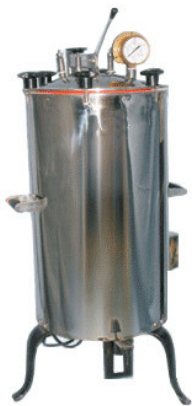
AUTOClave / STERILIZER